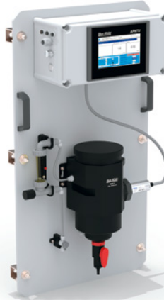
APNTU Online Turbidity Analyzer