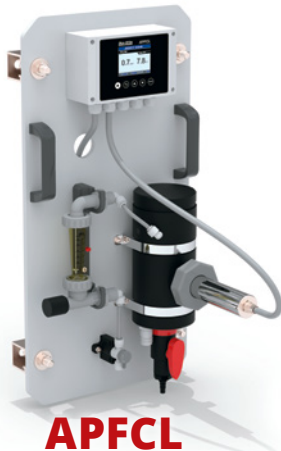
APFCL Online Chlorine + pH Analyzer

Blue-White's Analyzers are the turn-key monitoring solution for clean water applications, and installation is quick and easy.