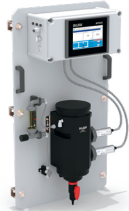
APH20 Multi-Parameter Online Analyzer